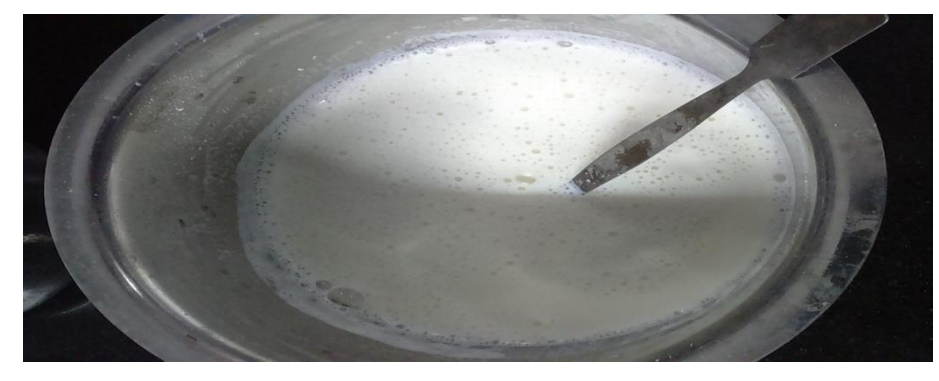
Fig: starting stage of milk for making flavoured milk.

The cow milk was standardized for fat and SNF by using Pearson's square method.