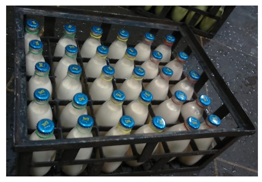
Fig: final product

Flow sheet: Preparation of sterilized flavoured cow milk