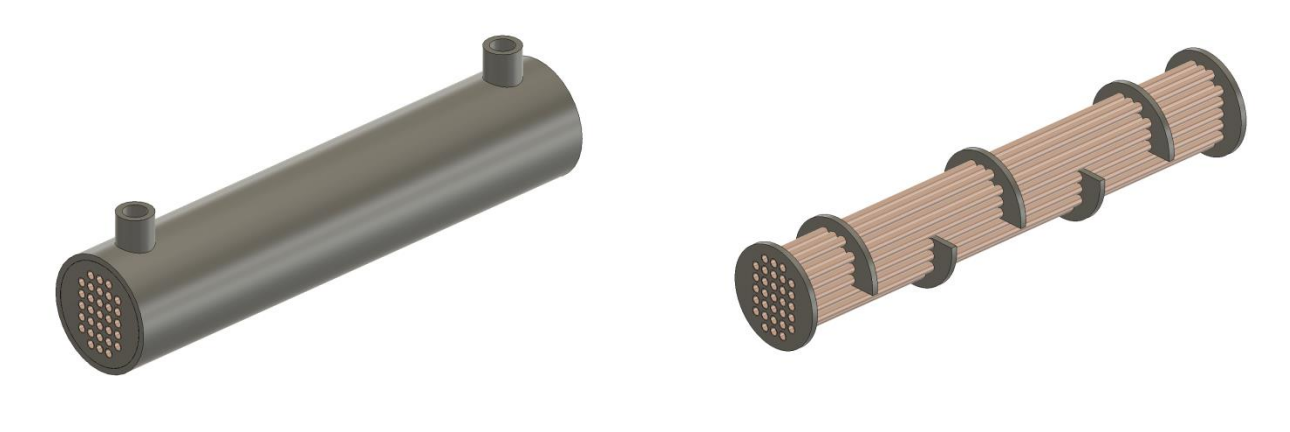
Figure: 1 Figure: 2

It is generally made up of round tubes and mounted in cylindrical shell. In candy plant shell and tube heat exchanger is transferring heat from brine to refrigerant (generally R-404A is more preferable). Two fluids are flowing in this heat exchanger one fluid (Refrigerant) is flowing in round tubes and another fluid (Brine) is flowing in the shell. Simple construction is shown in Figure-1 and Figure-2 shows internal structure of shell & tube heat exchanger.