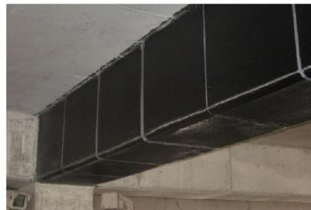
Figure No. 3 Carbon FRP fiber installation

Composite wraps or carbon fiber jackets are used for reinforcing and adding ductility to reinforced concrete and maceration components without any penetration. Composite wraps on reinforced concrete columns are most effective. Additional containment provided.