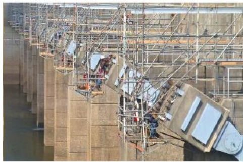
Figure No. 2 External Post Tensioning to restore or increase capacity