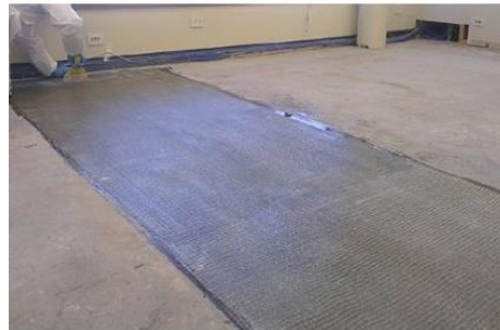
Figure No. 4FRP Composite Strengthening services Concrete solutions