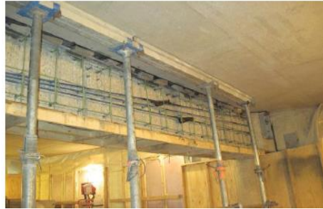
Figure No. 1 External Post Tensioning

One of the potentially efficient retrofit options for reinforced concrete or masonry buildings is the post-tensioning (Fig1). Masonry's compressive strength is relatively large, but the strength is only low. Therefore, it is the most effective in carrying loads of gravity. Induced tensile stresses usually exceed pressure and reinforcement to provide the necessary strength and ductility, must be added.