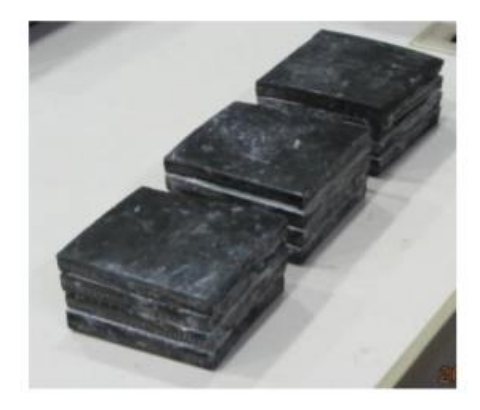
Figure 1 . Bounded STRP Specimen [1]

Elastomeric based isolators may be mimicked using pads made out of scrap rubber pads procured from automobile workshops considered as waste, which are called as scrap tire rubber pads. Automobile tires are made by vulcanizing steel mesh and cords with the rubber. When the tread part of the tires are removed and piled on the top of each other as rectangular rubber sheets, they form scrap tire rubber pad as shown in Figure 1 [1]. The tire bend is produced by cutting the tire ring in the transverse direction. The layers forming a scrap tire rubber pad can be sticked together using resin [4].