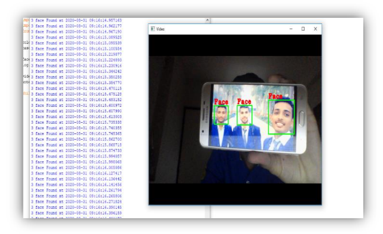
Fig. 7. Face detection in multiple faces.

In the above fig. 3 we input a single face via webcam and it detect and gives us complete result without any error or without any video lag in any frame. The present result is calculated based on face structure that already identify in cascade classifier.