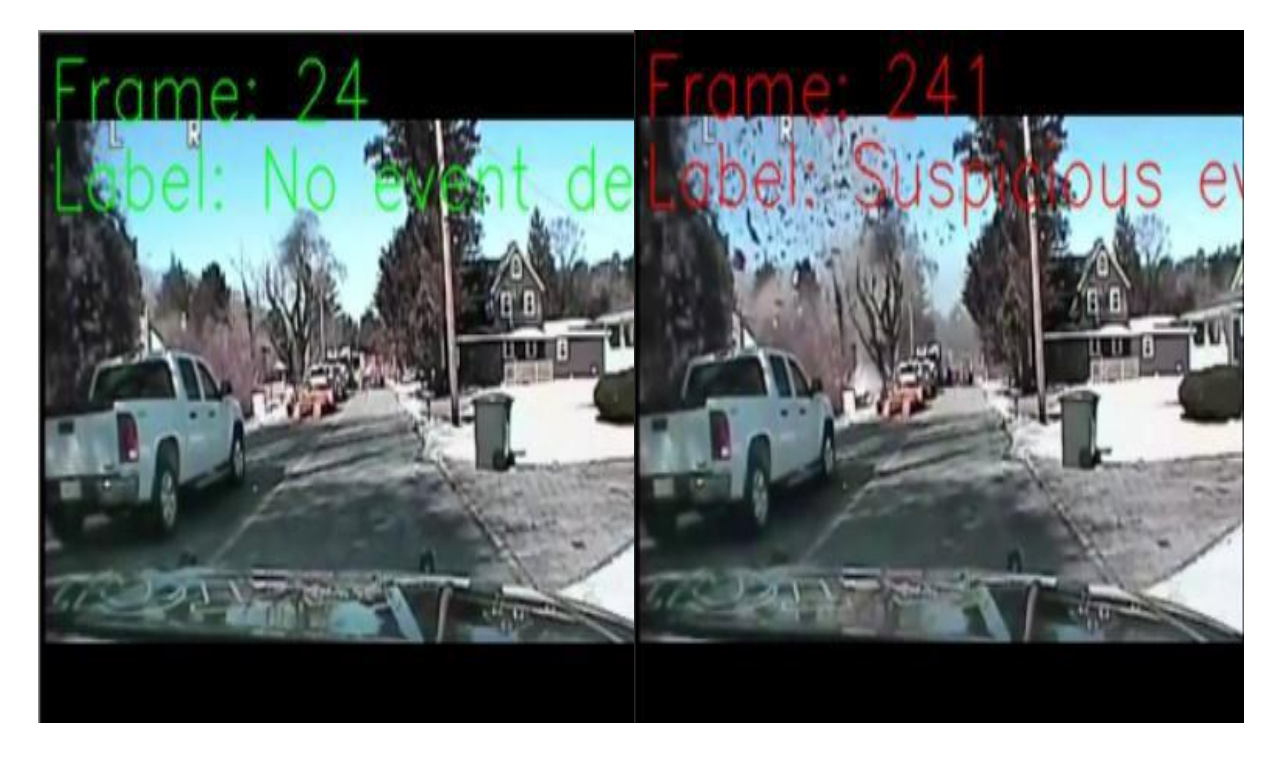
Figure No 3 : Suspicious Activity Detection

In the figures above, the green color indicates that the activity is not suspicious, while the red color indicates that the activity is suspicious. When a suspicious detection is detected, it will appear on the LCD screen and alert the user.